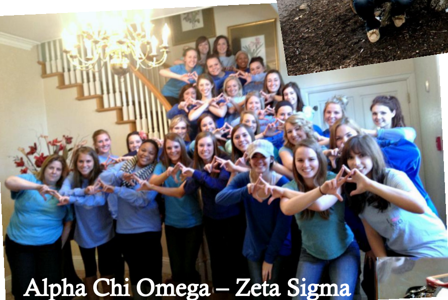
Alpha Chi Omega – Zeta Sigma