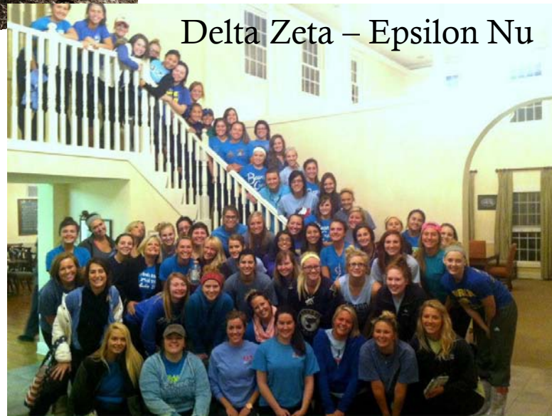
Delta Zeta – Epsilon Nu