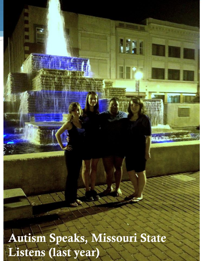
Autism Speaks, Missouri State Listens (last year)