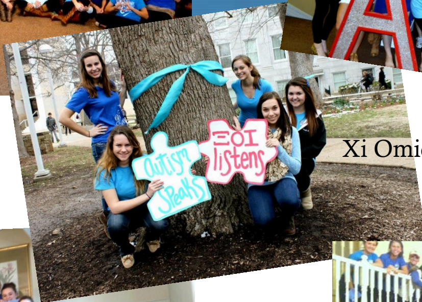
Xi Omicron Iota