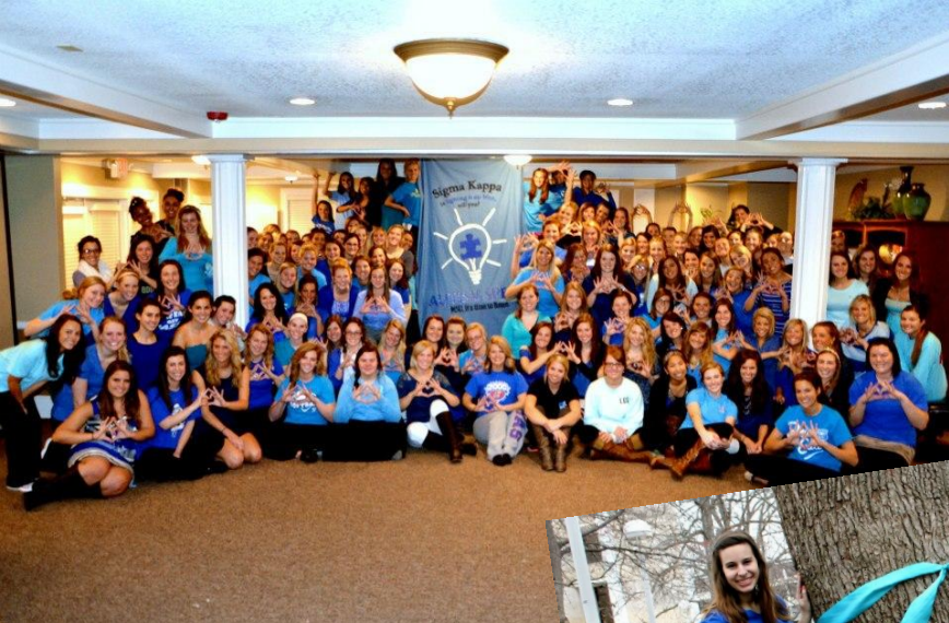
Sigma Kappa – Delta Upsilon