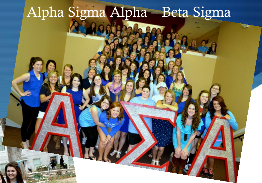
Alpha Sigma Alpha – Beta Sigma